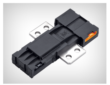
Figure 2. The IVT 3 Pro is qualified with an ASIL C rating for current measurements, ASIL B for voltage measurements and ASIL B for insulation monitoring.

IVT 3 series (Figure 2) can simplify the design process as it has been developed according to ISO 26262. The IVT 3 has recently been the first current sensor on the market to receive certification for compliance to ISO 26262 ASIL C functional safety level by an independent institute (TÜV Rheinland/KUGLER MAAG CIE).