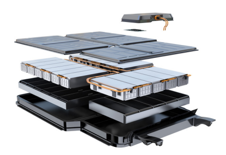
Figure 2. Detailed view of an EV's battery pack.

To enable good measurement properties, voltage shunts are typically individually tested to determine their resistance values at a set temperature. Since busbar shunt resistance is temperature-dependent, a temperature coefficient (TCR) is also needed for a full picture of its properties. Typical manufacturers measure this coefficient based on batches of shunts. Isabellenhütte, however, measures a