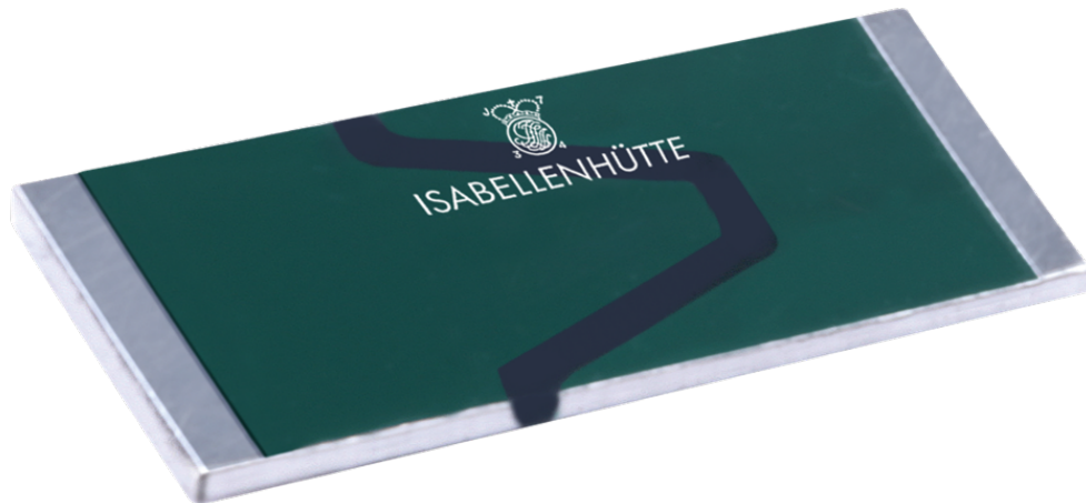
Figure 2. The 0.005 \Omega to 1 \Omega VMS precision and power resistor with a tin-lead contact plating for applicability in aerospace and defense.

For these reasons, and many others, designing space electronics or any non-terrestrial aircraft was often viewed as a niche field, relegated to state agencies and large corporations. NewSpace has redefined this trend, with smaller companies and research organizations launching small satellites with a limited mission life or developing drone technologies, which have more relaxed requirements for aerospace equipment in the quest for shorter lead times and cost-effectiveness. It is more common for radiation-tolerant components to be leveraged instead of their fully radiation-hardened counterparts.