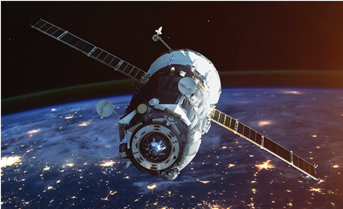
Figure 3. Tin whiskers tend to grow more rapidly in aircraft and spacecraft that operate at higher altitudes.

While this phenomenon is not exclusive to space, it tends to form more rapidly at higher altitudes. The vacuum of space presents a potentially catastrophic failure: the current required to open a short circuit caused by a tin whisker fuse is on the order of a few amps, but the vaporized tin can initiate a plasma that can conduct hundreds of amps, causing metal vapor arcs. In current-sense applications, a tin whisker is another potentially lossy electrical path that could lead to inaccurate measurements or no measurement at all.